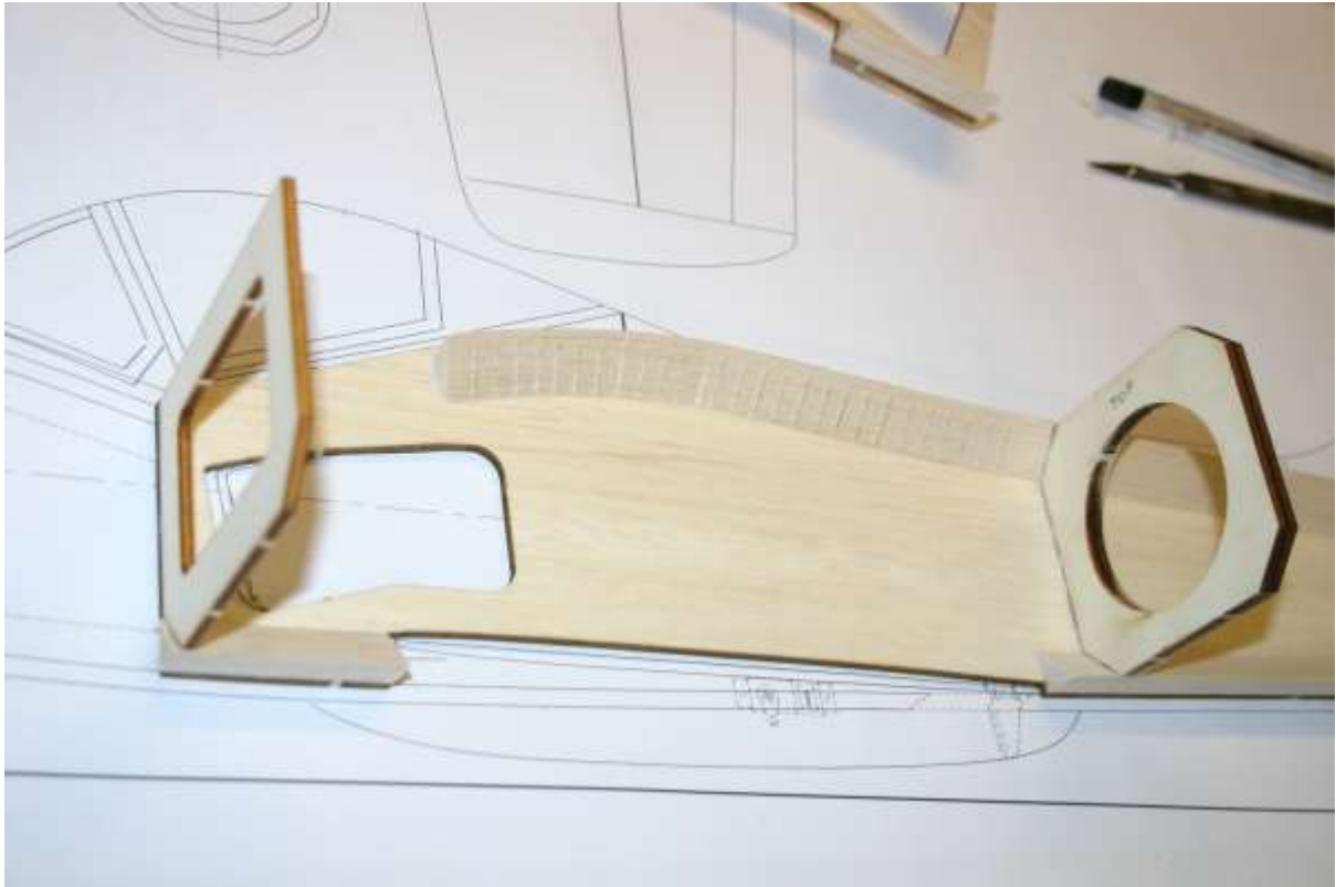
Add the formers 6/7 and 8