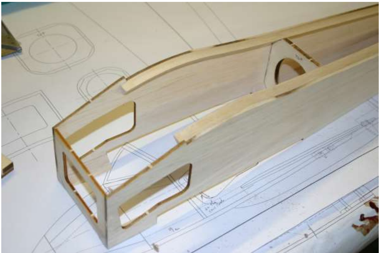
Enclose the other Fuselage side