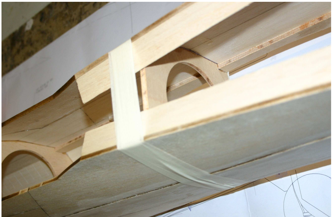
Wet outside surface of fuselage sides and only then attempt to bend on to F3, F4, F5 and F6